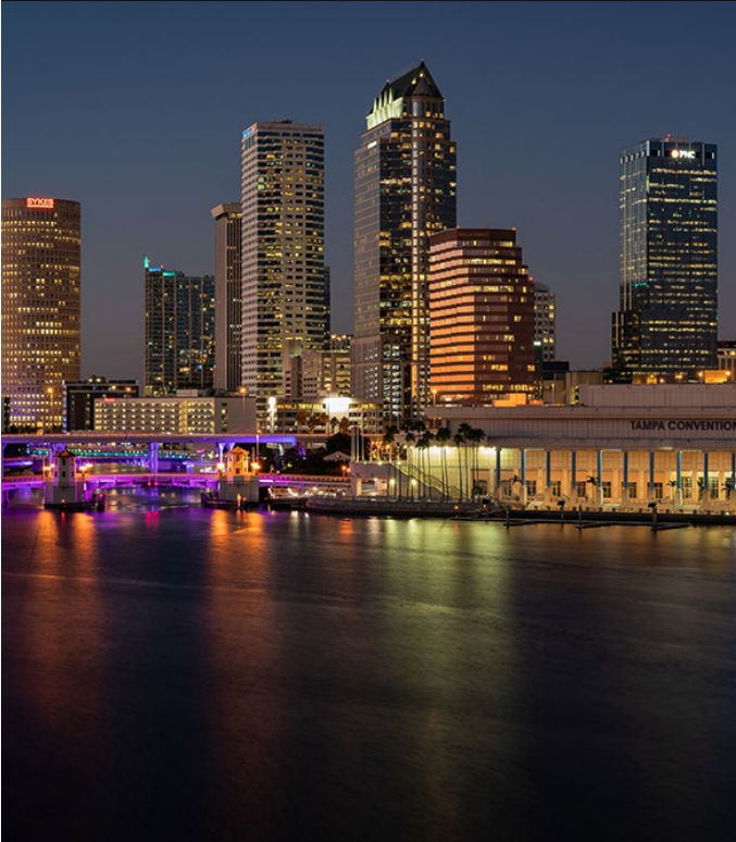
TAMPA BAY, FLA., AUG. 22 – 28, 2025