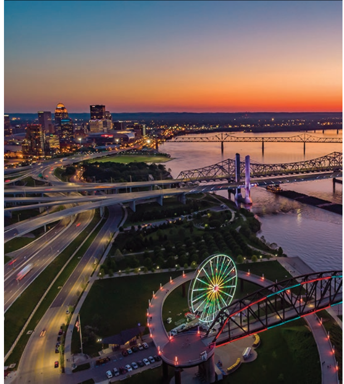
LOUISVILLE, KY., AUG. 28 – SEPT. 3, 2026