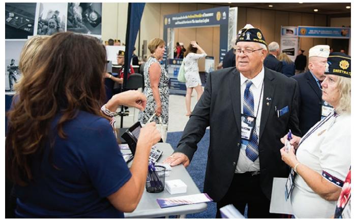
EXHIBIT HALL SECURITY

Security will be provided 24 hours a day inside the exhibit hall. The American Legion is not responsible for any lost, damaged or stolen items.