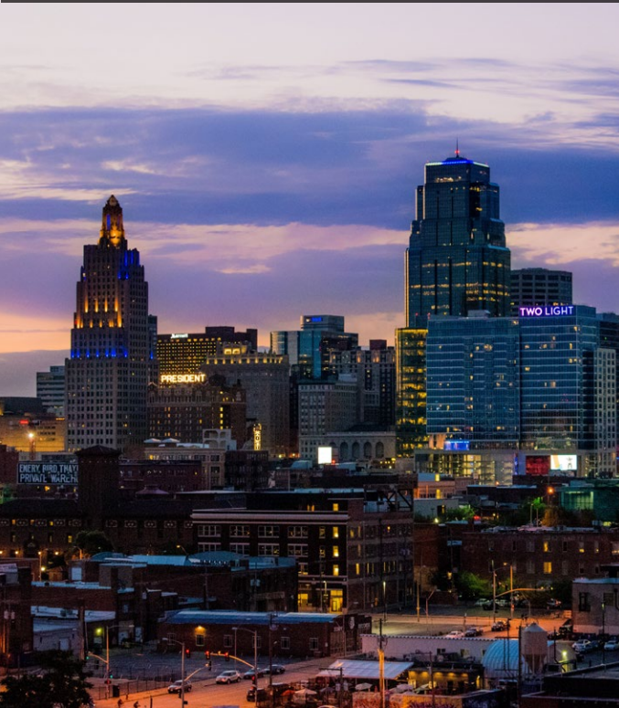
KANSAS CITY, MO., AUG. 27 – SEPT. 2, 2027